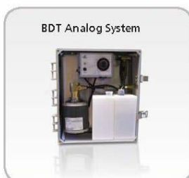
BDT Analog System