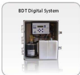
BDT Digital System