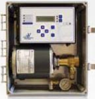
BMS Digital System